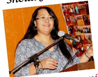
Mistress of Ceremonies

Time: Doors Open 2:00 p.m. Show Begins at 2:30 p.m.